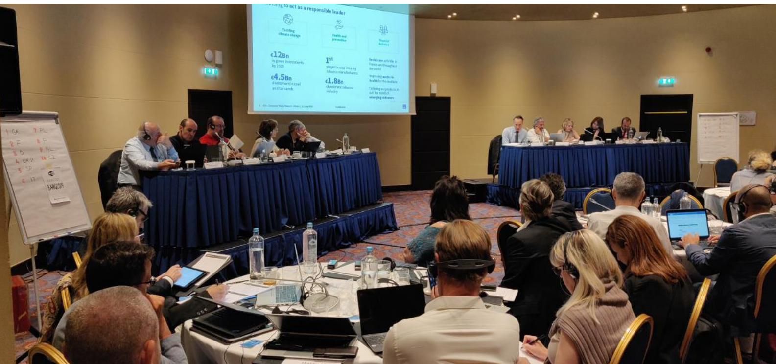
Next meeting: September 24th and 25th in Paris Follow the AXA EWC on Twitter @AXA_EWC